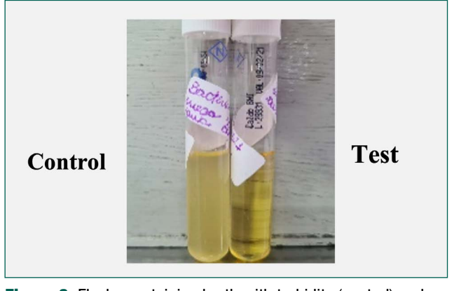
Figure 3. Flasks containing broth with turbidity (control) and without turbidity (test)

In general, the effectiveness of bacterial killing by the UV-C device on surface samples was greater when compared to air samples, as the elimination of microorganisms on surfaces was complete and its reduction in the air was substantial. The average count of bacterial colonies tested was significantly reduced after UV-C irradiation (15 min; 107 CFU vs. 0 CFU; p=0.005). Turbidity was not observed in the test broth, showing a highly effective disinfectant effect for multiresistant Gram-negative enterobacteria (Figure 3).