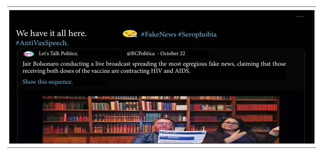
Figure 4. "We've got everything here". Florianópolis, Santa Catarina, Brazil, 2021.

ical and social context of AIDS. Quality of life, adaptation to the therapeutic regimen, development of interpersonal relationships, and prejudice in the family and work environment can pose significant challenges for people living with HIV. These challenges have become a global public health concern<sup>14</sup>. The central data uncovered in our study confirm these aspects and contribute to the advancement of scientific knowledge on the subject, especially by exploring the media's interest in serophobia on Digital Social Networks, which is a valuable aspect for collective health analysis.