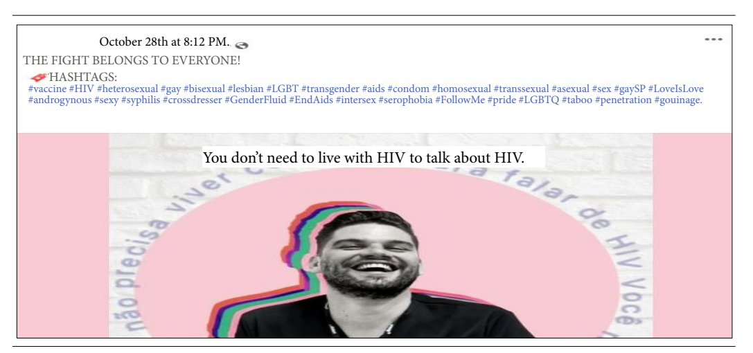
Figure 2. "The fight is for everyone". Florianópolis, Santa Catarina, Brazil, 2021.