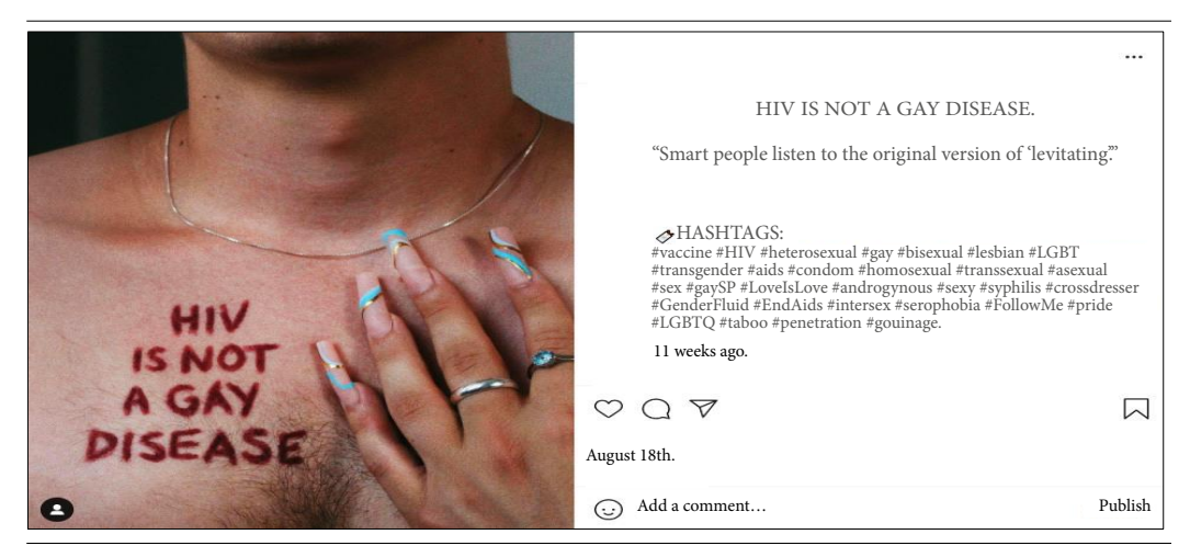
Figure 1. "HIV is not a gay disease". Florianópolis, Santa Catarina, Brazil, 2021.