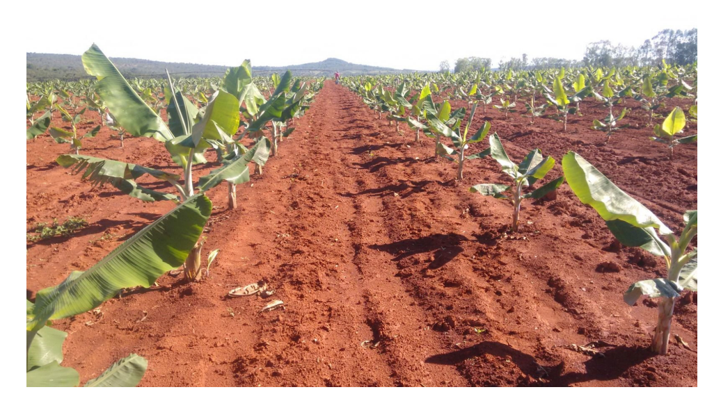
Figure 2: Banana plants of the Prata Anã variety, Gorutuba clone, used in the experiment.