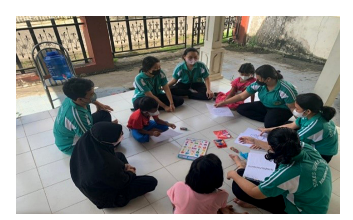
Figure 2 - Skill, attitude & performance assessment

In the intervention group, they were given an interactive multimodality textbook for pediatric nursing in the form of an e-book for 4 months to be studied independently. Students in this group were asked to learn using the self-directed learning method.