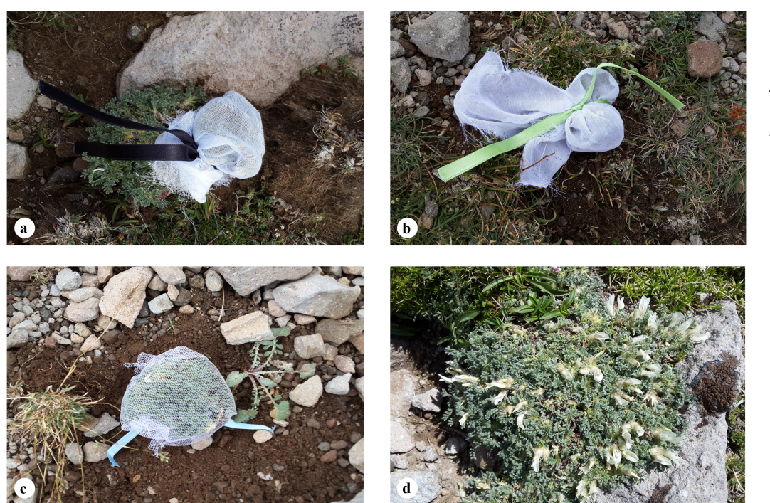
Figure 1. Pollination experiments of A. argaeus (a. autogamy, b. Agamospermy, c. Wind pollination, d. Control).

was dropped directly over the pollen grains. The pollen preparations were incubated for approximately an hour at 35-37 °C. Leica DM750 light microscope was used to examine pollen preparations. A total of 500 randomly selected viable and non-viable pollen grains were counted in 5 replicates and the percentage of viability was calculated daily (Firmage & Dafni 2001).