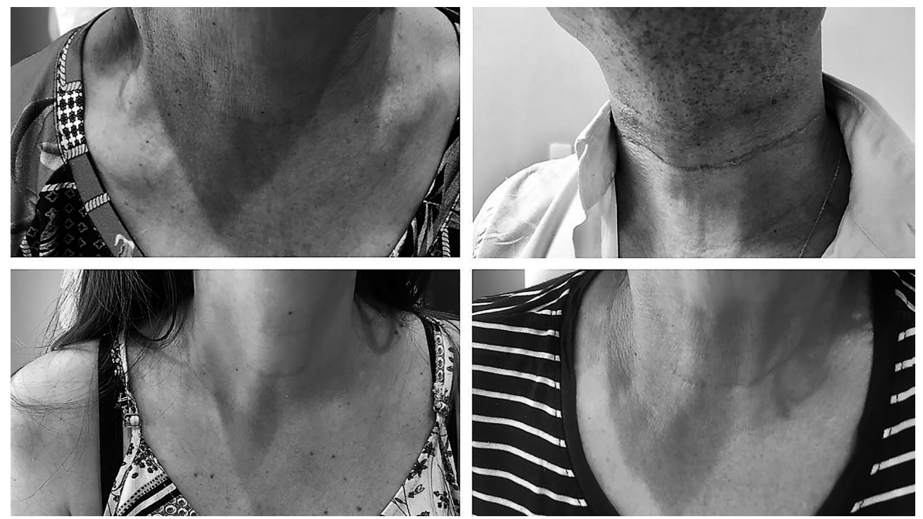
Figure 2. Four examples of patients satisfied with their conventional thyroidectomy scars.

Figure 1. Sample characteristic graphs (age/sex distribution and thyroidectomy type performed).