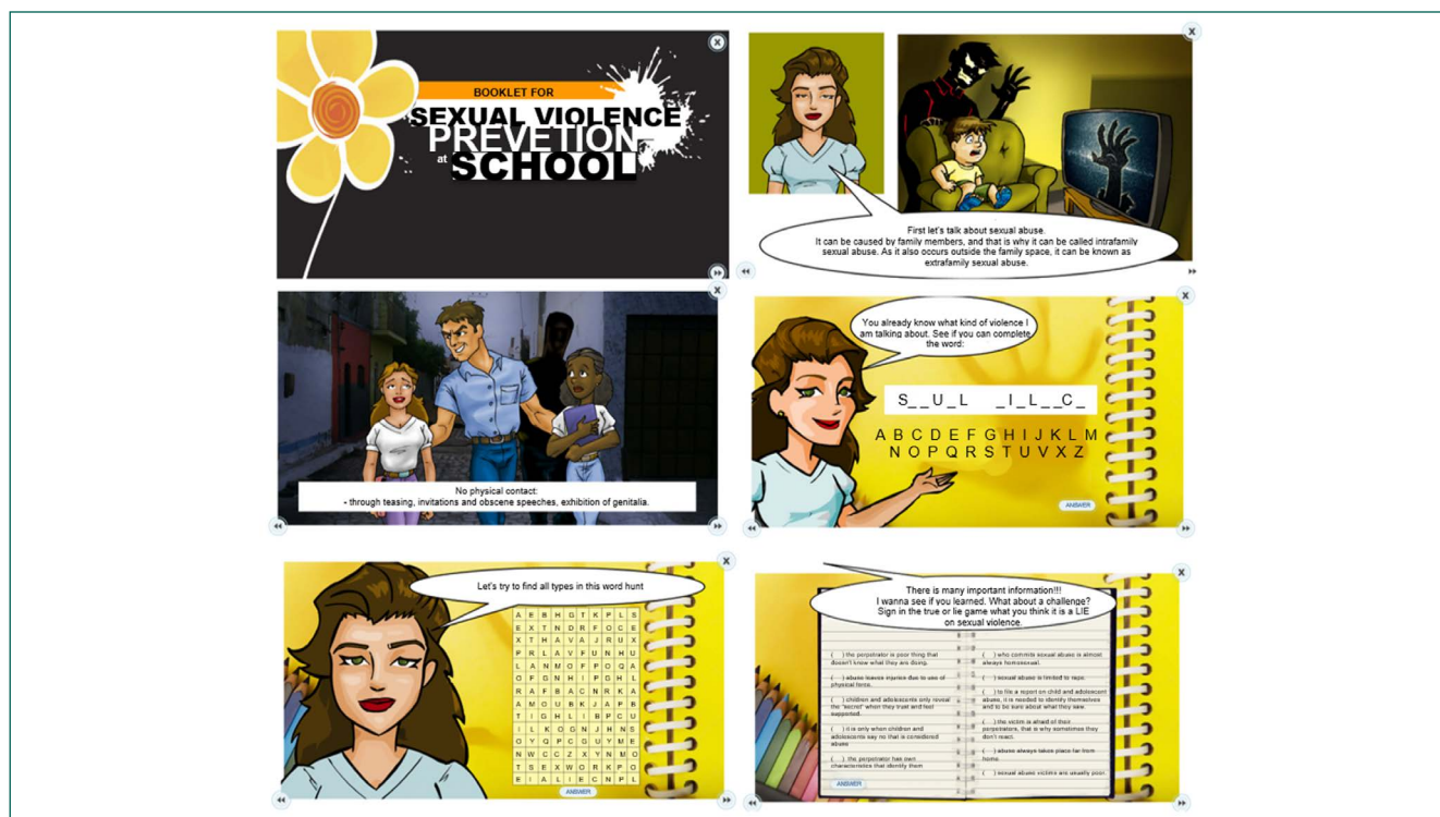
Figure 2. Some screens from the digital booklet “Prevention booklet: sexual violence at school”