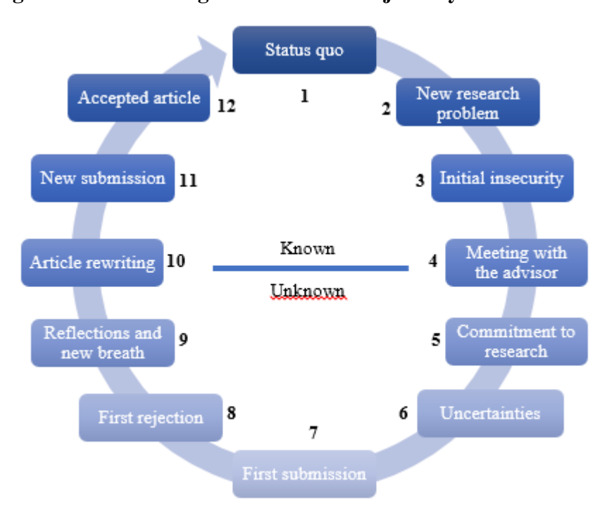
Figure 3 – Twelve stages of the scholar's journey toward scientific publication

Equating scientific activity with the hero's journey will be presented with an emphasis on understanding how to overcome each stage of the process of writing a scientific text. The twelve stages of this journey will be explored until reaching the researcher's goal: publicizing his research. Figure 3 presents the academic journey, from the formulation of a new research problem to the publication of the study.