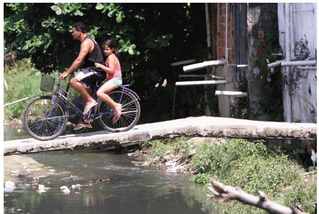
Residents of the Curicica favela in Jacarepaguá (RJ), release sewage directly into the streambed.