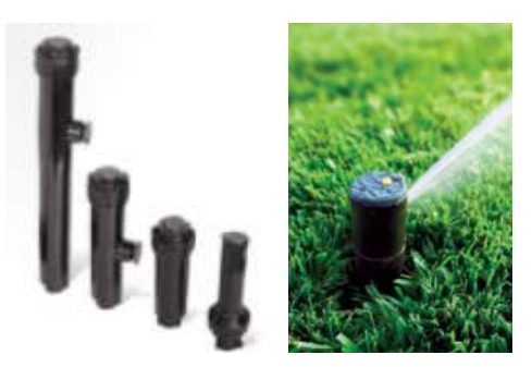
FIGURE 10. LF2400 Sprinkler Installed on RainBird Surface.