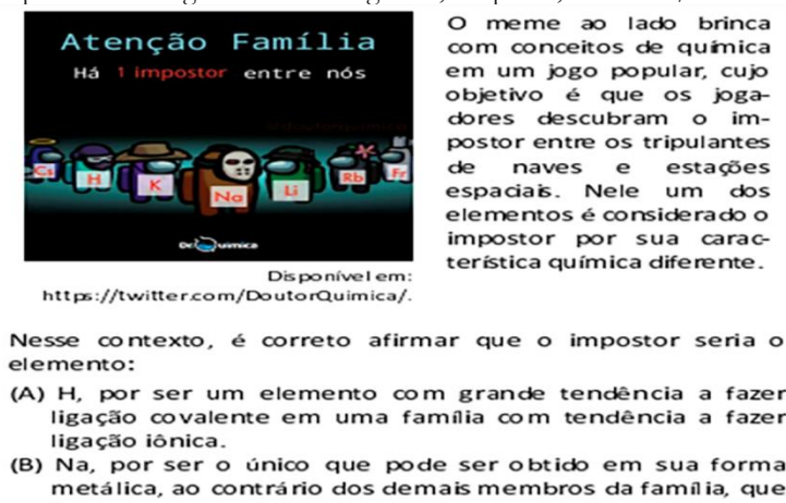
Figure 4 - Meme-4 present in the general knowledge test, 1st phase, of Fuvest/USP 2021 entrance exam

(C) K, por ter raio atômico atipicamente grande, sendo maior do que os elementos abaixo dele na tabela periódica. (D) Cs, por pertencer à família 2 da tabela periódica, enquanto os demais pertencem à 1, formando cátions +2. (E) Fr, por reagir violentamente com a água, devido ao seu pequeno raio atômico, liberando muito calor, diferentemente dos demais elementos da família.