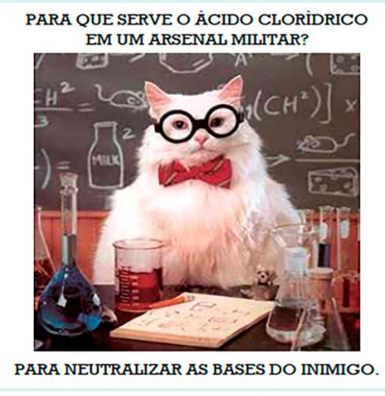
Figure 1 – Meme-1 present in the 2nd phase test, of the UERJ 2016 Chemistry discursive questions exam