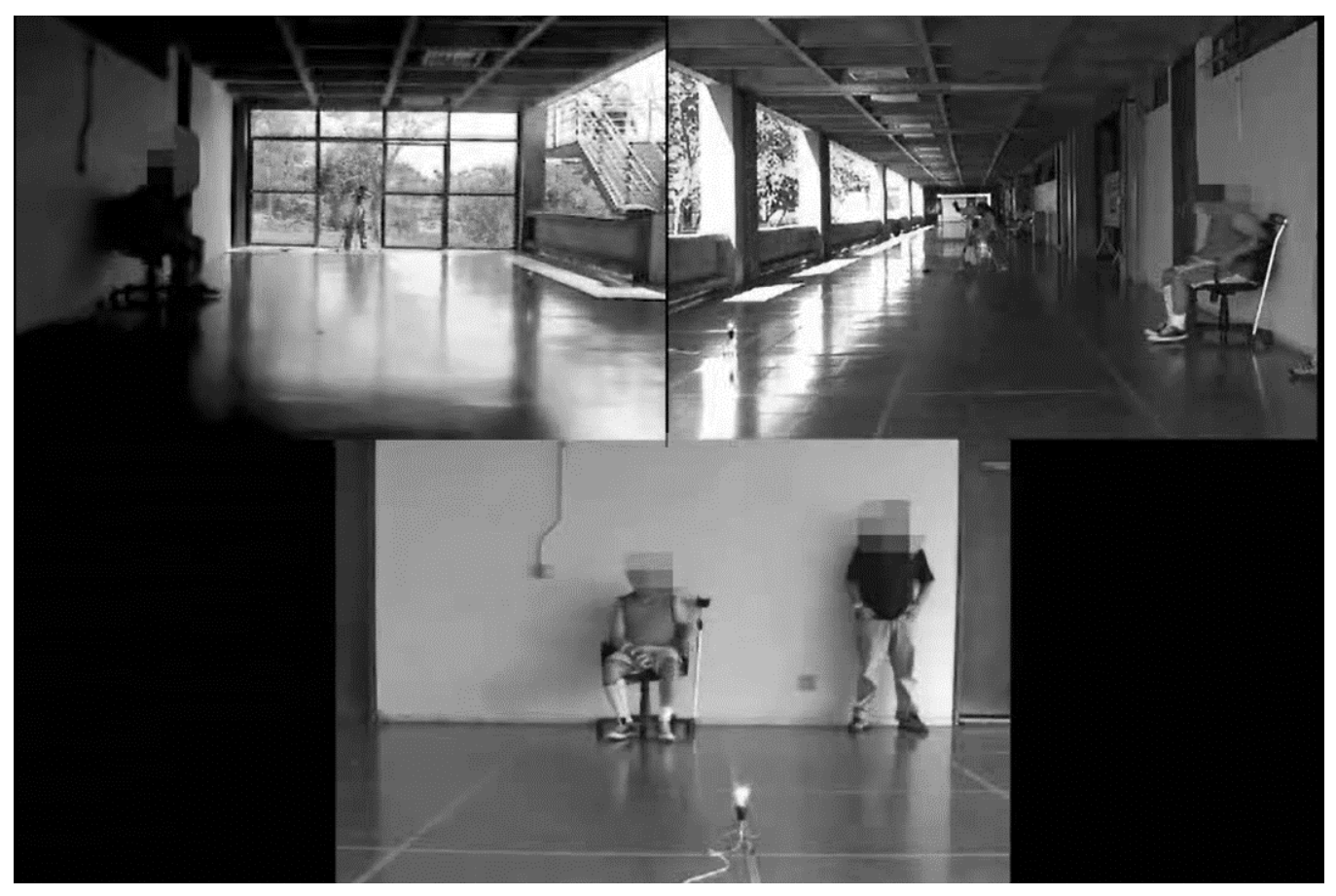
Figure 1. Performance of the timed "up and go" assessment of biomechanical strategies (TUG-ABS) test