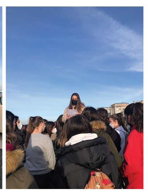
Figure 1. Location of the symbol, photo essay.

In response to this question, an artivist project is designed, "The Wound and its Contours", organised around performance and aimed at mental health prevention, which represents mourning through symbolic acts that, when repeated, allow suffering to be expressed and shared, placing pain on the map of vital learning (Figure 2).