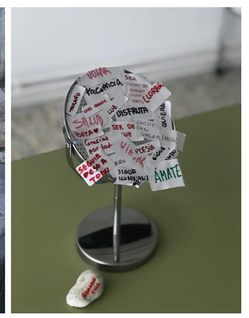
Figure 2. The wound and its contours, photo essay. Photograph: Authors.