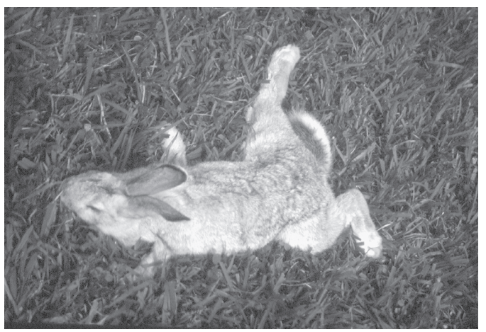
Fig.1a. Incoordination of the pelvic limbs, weakness, flaccid paralysis of the skeletal musculature, inability to make movements, and sternal/abdominal decubitus.

formulation was changed. The owner had requested the feed manufacturer to modify the ration for a better control of coccidiosis, which caused significant economical losses at that time. Consequently, the coccidiostatic sulfaguinoxaline was substituted by salinomycin. Clinically, the animals showed anorexia, apathy, incapacity to raise the head and bradykinesia that progressed to incoordination. Later, the rabbits became recumbent at/in bizarre positions (Fig.1a,b). Generalized loss of muscle tone was also evident. Some rabbits showed extreme muscular flaccidity. to the point that they were unable to make any movement and remained in the position they were left when placed on the floor. There were dirty, with matted hair in the posterior region, and semi-liquid feces in the perianal region. Finally, the animals were unable to make any movement and died within 48 to 72 hours. The macroscopic examination of the 27 rabbits revealed a lighter color of the muscles throughout the body in several cases. One rabbit exhibited dark urine. In two animals, part of the small intestine was filled with a mucous-gelatinous substance,