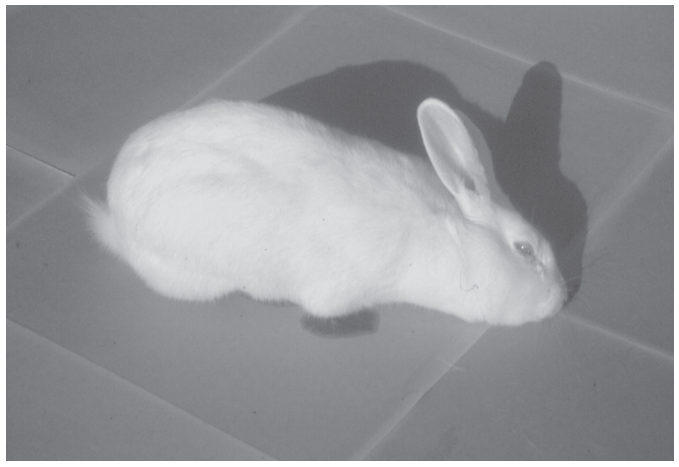
Fig.1b. Animal with difficulty to move and unable to stand or raise the head because of the lesions in the cervical muscle.