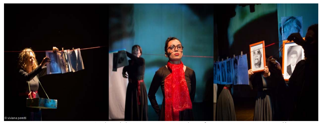
Image 3 – Antígonas Tribunal de Mujeres.

The paths of individual and collective resistance and repair that Antigonas Tribunal de Mujeres has forged have been crucial for acknowledging these crimes in various forums. Additionally, it has contributed to raising awareness and understanding of the issue within society, prompting the public to recognize the State's involvement in these crimes.