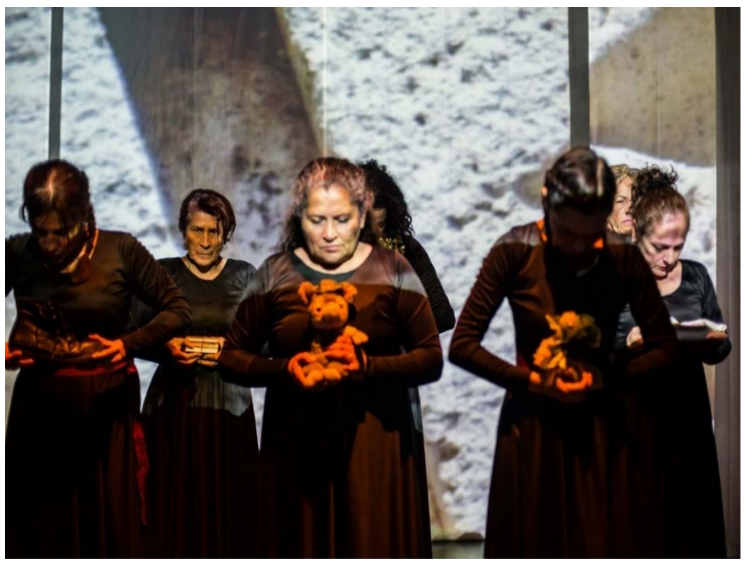
Image 5 – Antígonas Tribunal de Mujeres – Tramaluna Teatro. Dec 02, 2021. Source: Photography by Juan Domingo Guzmán<sup>12</sup>.

of resistance and denunciation). In this sense, we understand that the creation of poetic repertoires, on a practical level, expands the notion of the traditional archive. It becomes public, permeated by time, space, and the significance it assumes within the theatrical representation (Taylor, 2017b). In this research, we refer to these creations as "resistance archives", recognizing that they act as evidence of the past, refusing to be forgotten with each assertion for life made by every performance of the Colombian Antigones.