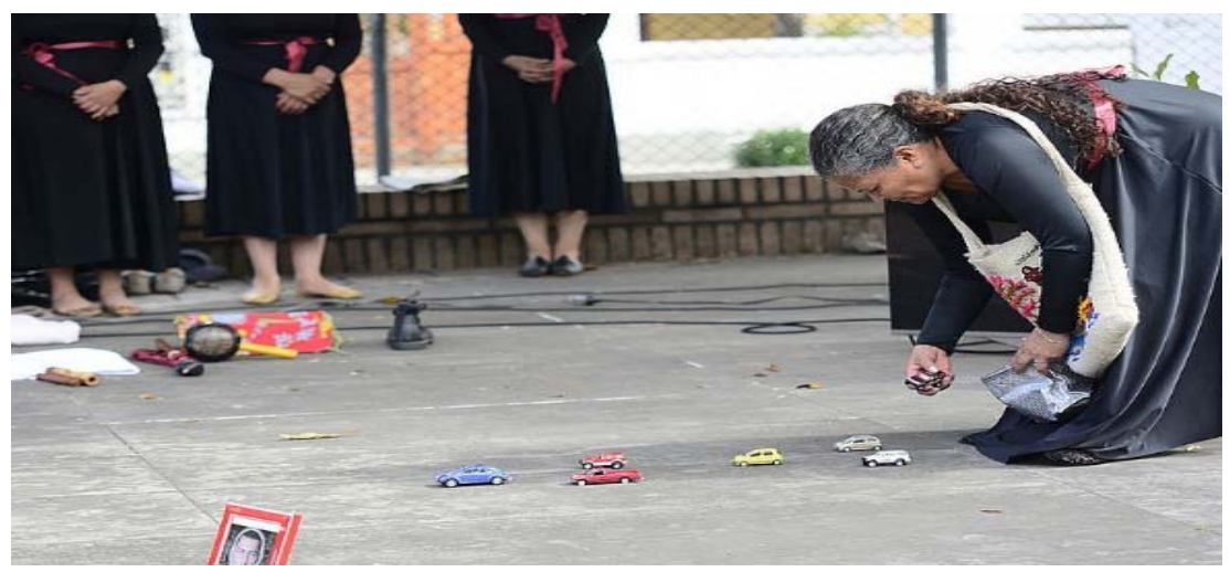
Image 4 – Antígonas Tribunal de Mujeres.

The methodological implications of this departure from logo-centric logic, which has historically constituted the most traditional ways of comprehending knowledge and transmission systems, draw attention to the valorization of an expressive, embodied culture. This shift redirects the focus of writing toward embodied culture. As Taylor (2017b), suggests Instead of concentrating on patterns of cultural expression solely in terms of texts and narratives, we should think of these as scenarios, which are not reduced to gestures and embodied practices to a narrative description. Analyzing the experience of Antigonas Tribunal de Mujeres from this perspective is a commitment to embodied knowledge. It seeks to comprehend how the theatrical elaboration of material and immaterial memories of the play's members operated as methodological devices of creation, potentially replicable in other contexts to generate alternative narratives of truth. This approach recognizes the power of testimony as a source of knowledge (Levi, 1990) and regards performance as a routes to transcend testimonial narration, leading to the creation of poetic and political archives and repertoires that shed light on different aspects of women's experiences in times of war.