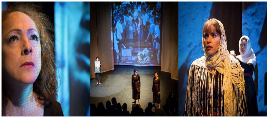
Image 8 – Antígonas Tribunal de Mujeres. Source: Photo of Triptych by Viviana Peretti, 2017<sup>19</sup>.

In the play Antigones Tribunal de Mujeres, a distinctive scenic composition is achieved by intertwining the potency of the Antigone myth, real-life tragedy, and the performers' repertoires constructed from archives and memories. This artistic exercise allows the Antigones to summon on stage the material presence of their murdered relatives, presenting "embodied memories" that manifest as a language expressed through gestures, words, movements, dances, songs, and objects. Through these multifaceted elements, they convey a nuanced understanding of lives engaged in resistance. The Antigones craft monologues that delve into their affective memories and archives, employing diverse languages for expression. These monologues are interwoven with choral and choreographic sequences, wherein the bodies of the Antigones unite to convey the potency of bodies in alliance (Butler, 2018) and narrate the story of a tragedy systematically replicated throughout history. This emphasizes the harsh impact of war and social violence on vulnerable communities, particularly affecting women.