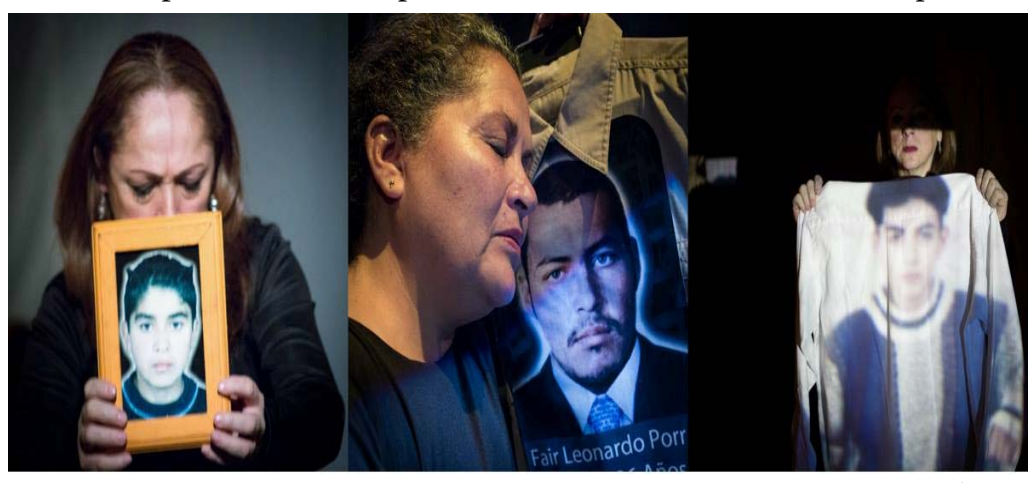
Image 6 – Antígonas Tribunal de Mujeres.<sup>14</sup>.

The development of these poetic repertoires occurred through various scenic tasks and theatrical improvisations in which personal objects served as devices for recreation. Additionally, these objects, already carriers of affective memories, also operated to bring the presence of absent bodies onto the stage. In this way, these objects functioned as material transmitters of the lives of the absent individuals and as a means of connecting the experiences, joys, pains, and struggles of the play's protagonists within the context of war and armed conflict. They presented to the audience lives marked by years of persecution during which they were forbidden to express themselves or denounce. These inputs within the play serve to reveal fragments of an untold, unrecognized, denied truth – the truth of a pain left by the war in Colombia. It accompanies us as a society and, at the same time, has been eradicated, prohibited: a pain that is not spoken about (Núñez; Millán, 2020, p. 41).