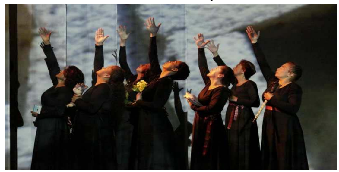
Image 2 – Antígonas Tribunal de Mujeres – Tramaluna Teatro. Dic 02 2021.