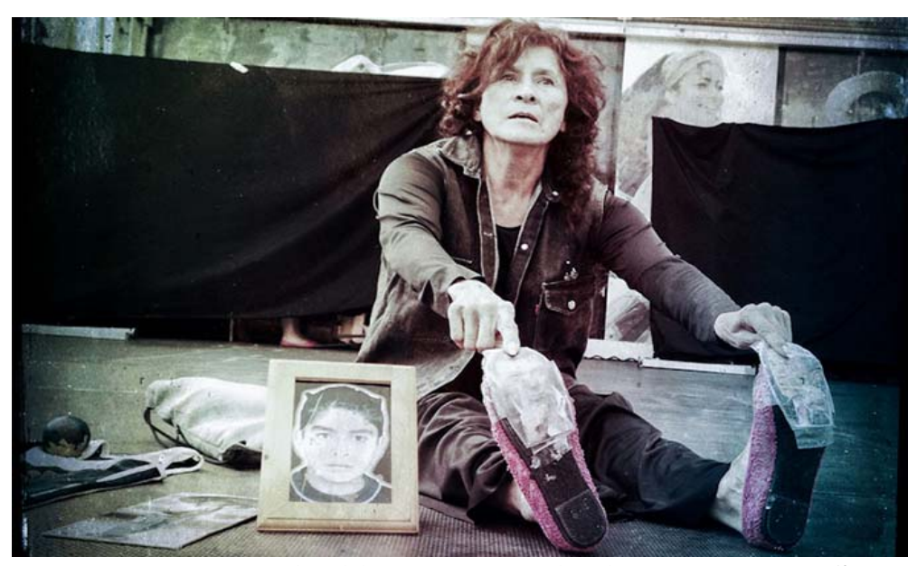
Image 7 – Antígonas Tribunal de Mujeres.<sup>18</sup>.

Just like Luz Marina, the violence that women have experienced in the devastation that the conflict has generated has also generated a strange way of inhabiting the world: the desolating experience of violence and loss. In many societies, in the work of mourning, the antiphony of language and silence recreates the world amid tragic loss through transactions between language and the body (Das, 2016)<sup>17</sup>. Therefore, transitions between the body and language bring forth an expression of the world in which the strangeness of the world revealed by death, due to its uninhabitable condition, can transform into a world where it is possible to dwell again, with full awareness of a life that has to be lived in loss.