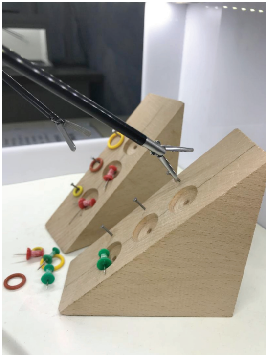
Fig. 3 Training module 2.