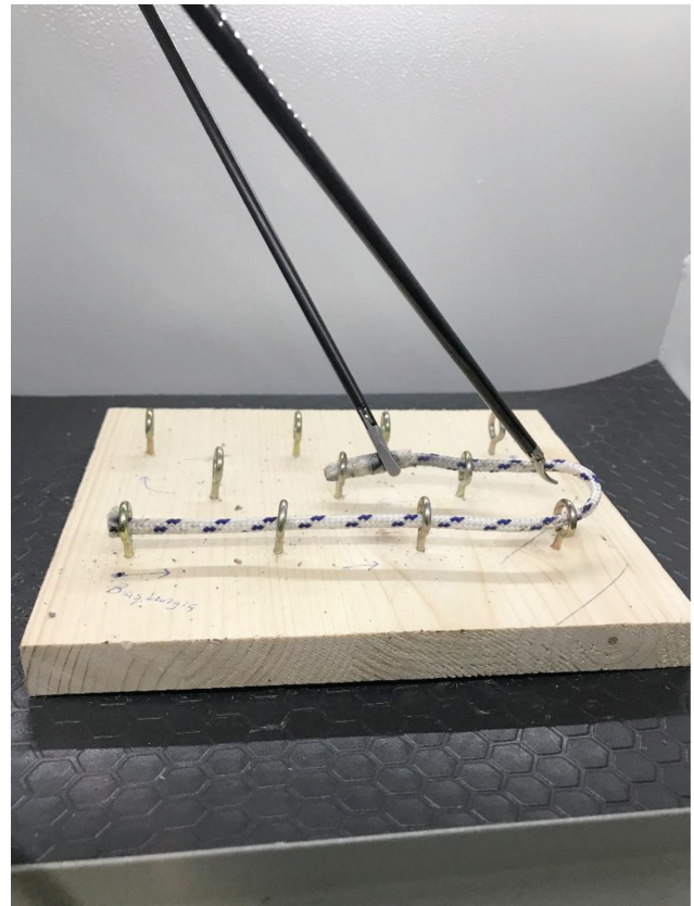
Fig. 5 Training module 4.