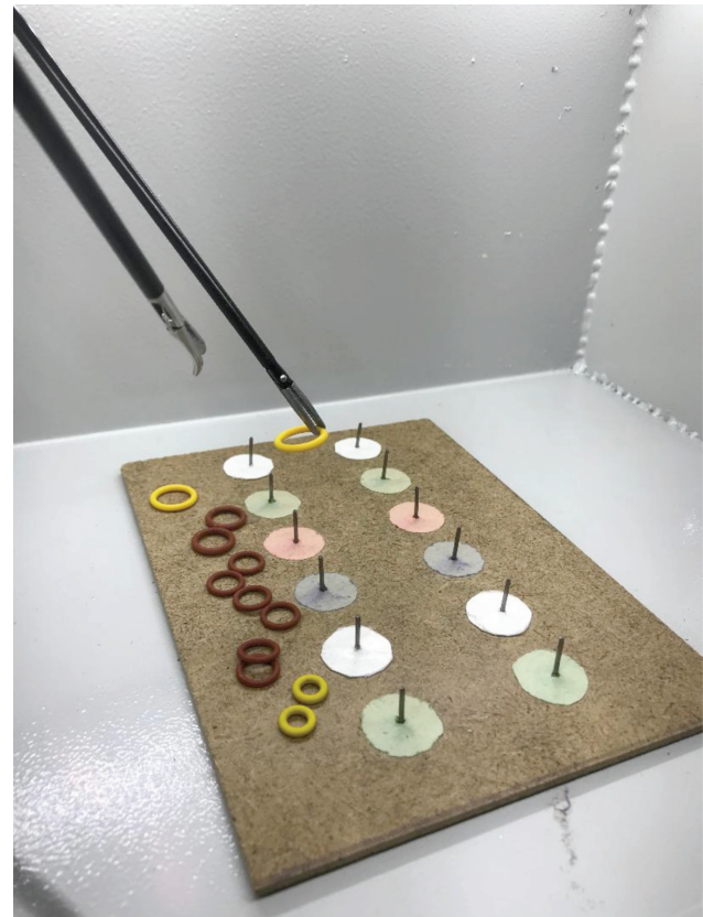
Fig. 2 Training module 1.

© Omer Lutfi Tapisiz's ORCID is https://orcid.org/0000-0002-7128-8086 .