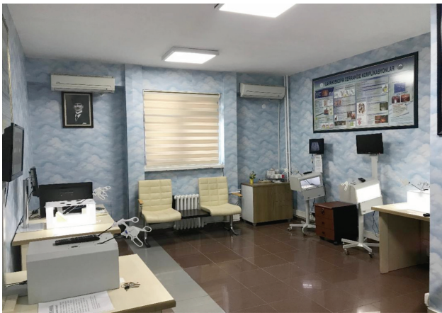
Fig. 1 View of the laparoscopic training room.

In ►Fig. 2, the training module (TM) 1 is presented. In this TM, the surgeon should attach the rings to the nails while