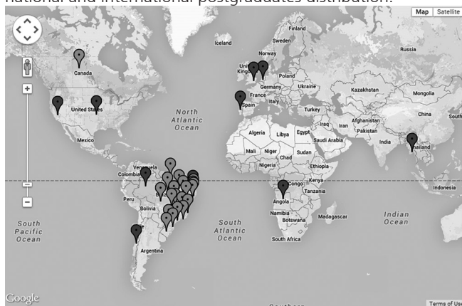
FIGURE 5 - Ophthalmology and Visual Sciences - UNIFESP program site, showing national and international postgraduates distribution.

Interesting is the map shown in Figure 5, taken from Ophthalmology and Visual Sciences - UNIFESP program site, showing national and international postgraduates distribution.