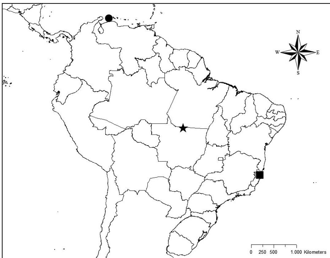
Figure 1. Location of new record of centipede predation in the Cristalino State Park, Novo Mundo, Mato Grosso, Brazil, indicated in the map by a solid star. The solid square indicates the register in the Atlantic Forest, Brazil and the solid circle indicates the register in Venezuela.

The event occurred at Cristalino State Park (055°49'W; 09°27'S, Figure 1), a 180.000 ha public-access protected area located in northern Mato Grosso state, central Brazil. The reserve is located in the southern part of the Amazonian Biome. Phytogeographically, forest at Cristalino State Park is classified as a Semi-deciduous Seasonal Forest. Following the Köppen (1936) classification, the climate is Am (tropical moonsonal),