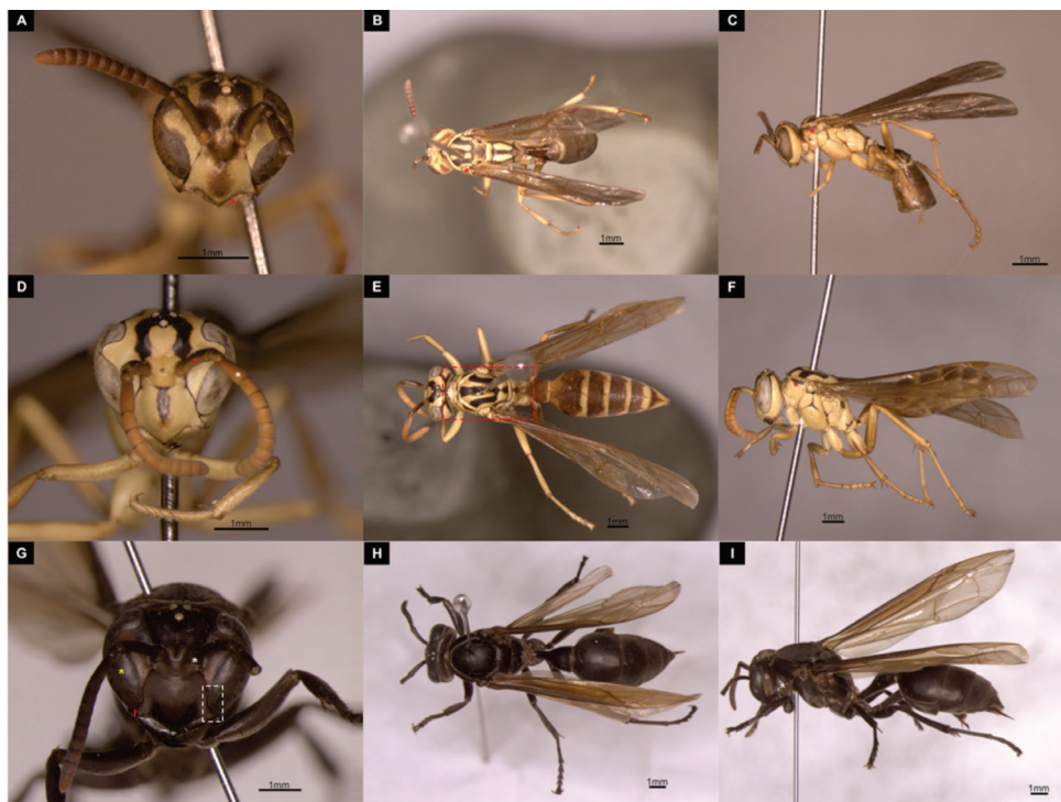
Figure 3. Frontal, dorsal and lateral view of species sampled in southeastern Acre as new records for Brazil. A-C, Agelaea baezae ; D-F, Agelaea pleuralis ; G-I, Polybia similima . Ventral margin of clypeus reddish tinged (A); tegula less accuted (B); pronotal keel broader (C). Antenna with scape black above, yellow beneath and pedicel and flagellum ferruginous (D); dorsum with extensive brown or black maculation (red rectangle - E); lamellate anterior margin of pronotum not markedly sinuate below fovea (F). Eyes bare, malar space very short, clypeus in contact with the eyes for a distance greater the height of antennal sockets (white rectangle - G); pronotal keel distinct on the shoulders, prominence in front of the fovea strong but not sharp (I). Structures are indicated by asterisks. This figure is in colour in the electronic version.