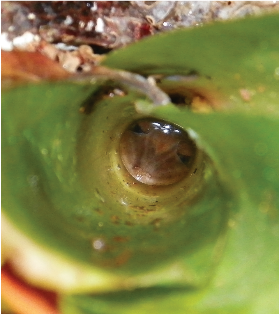
Figure 3 - Aparasphenodon arapapa male in a bromeliad, municipality of Ilhéus, Bahia Brazil.