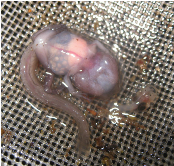
Figure 2 - Metamorph of Aparasphenodon arapapa with eggs inside digestive system; in Mussununga vegetation of southern Atlantic Forest of Bahia, municipality of Ilhéus, Brazil.

and eggs recorded in the study period are presented in Table S1 (Supplementary material). At least 64.7% of bromeliads that contained tadpoles and 66.7% of bromeliads that contained eggs were also occupied exclusively by a male of A. arapapa . We observed that tadpoles ate eggs until advanced stages of development (Figure 2). We also found tadpoles in different stages in the same bromeliads. The animal pole color of the eggs was dark gray with diameter varying from 0.50 to 0.97mm (mean \pm SD: 0.78 \pm 0.14; N = 24). Ovarian follicles of two females presented oocytes in different stages of maturity.