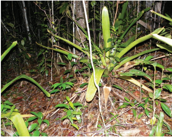
Figure 1 - The study area of Aparasphenodon arapapa at the municipality of Ilhéus, state of Bahia, Brazil.

vocal sac was undistinguishable. Females were recognized by visual inspection and detection of oocytes (when gravid) and also by their position during amplexus. We recorded the highest number of males in calling activity at one point of the trail at least twice on each field trip, between 18:00h and 24:00h. All individuals we found were measured (with a caliper of 0.01 cm precision) and weighed (with a field scale of 0.1 g precision). We followed Waichman (1992) for toe-clipping and individuals were released at the same site where they were found. Operational Sex Ratio was the mean of the number of females divided by number of males each day (Elmberg 1990). To test the null hypothesis of no difference on the snout-vent length (SVL) and body mass between males and females, we conducted a Mann-Whitney test. Mean occurrence frequency of males and females by night were obtained by dividing the total number of individuals recorded in the area along the whole study period by the number of field trips. To verify whether the mean number of calling males per month differed along the year we applied the Kruskal-Wallis test. To evaluate whether male calling activity was associated to each environmental variable (rainfall, temperature, humidity), we used the Spearman Correlation test. Temperature and humidity maximum values were recorded with a