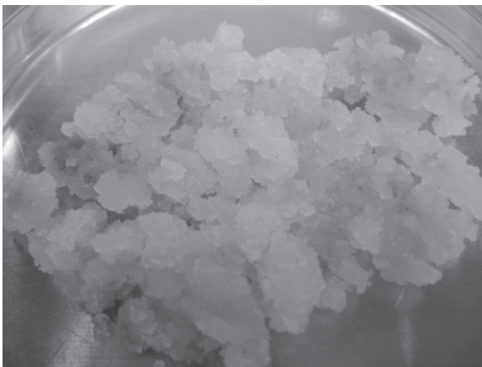
Figure 1 - Callus of Boerhavia paniculata Rich. from seed without coats in \frac{1}{2} MS medium supplemented with 10% (v/v) coconut water and 1.5% of glucose and 2.265 \mu M of 2,4-D (w/v) sub-cultivated after 60 days.