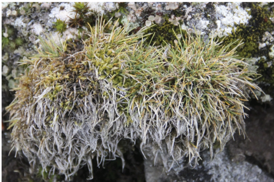
Figure 2 - Symptoms of P. deschampsii on D. antarctica leaves.

Phaeosphaeria microscopica (Karsten) O. Erikss. was reported by (Stchigel et al. 2004) to Antarctica, a widespread species, which differs specially by ascospore septae number (only 3 septa).