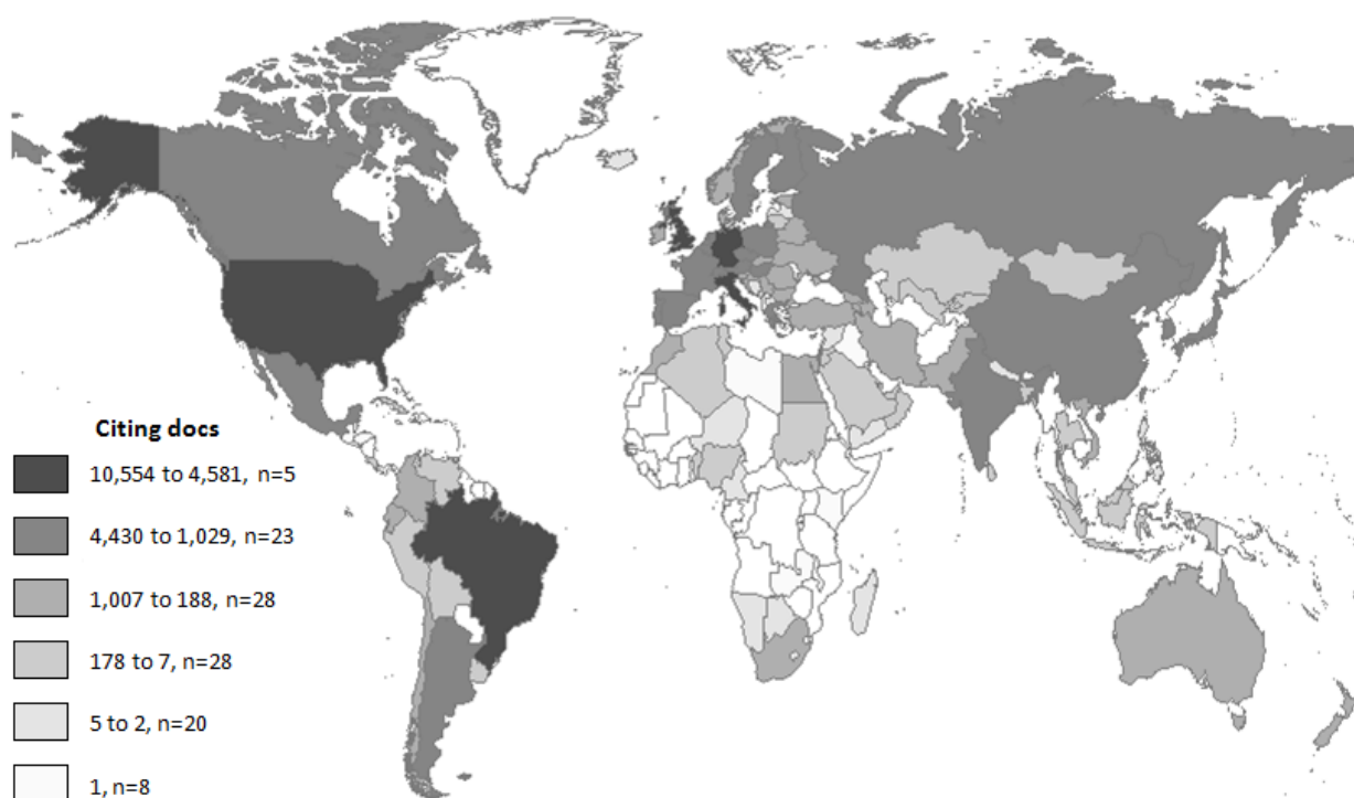
Figure 3 - Geographical distribution of citing documents (all types) for Brazilian HEP, 1983-2013.

Russia and France are the country's main partners. Relative indicators show decentralization and diversification in national collaborations. The high number of foreign researchers in citing documents (all types) underscores the global prestige and visibility of local production. The results of the analytical characterization suggest a maturation process in the Brazilian HEP community as a result of its long history in experimental research. Indeed, the status of Associate Member of CERN may boost Brazil's credibility in long-term projects, consolidate areas of expertise on instrumentation and data analysis tools (software programs), and enhance the influence of the country's science in the international arena. The scenario of highly internationalized HEP participation of Brazil follows the international trend in which productivity and impact are associated with large and multicultural groups.