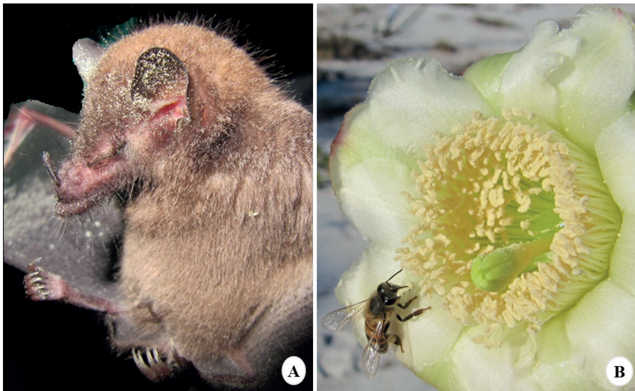
Figure 2. Anoura caudifer the effective pollinator of C. crassisepalus (A) and Apis mellifera visiting the flowers of this cactus species (B).