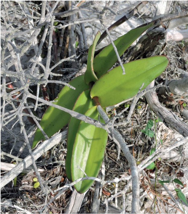
Figure 2. Individual of Epidendrum cinnabarinum Salzm. in Área de Proteção Ambiental das Lagoas e Dunas do Abaeté, Bahia, Brazil, showing the typical totally green foliage of the species.

lack of a relevant variegated phenotype in wild populations (Marcotrigiano 1997). All of these characteristics could be observed or related to the present case. The hypothesis of virus infection is ruled out since viruses in orchids often promote asymptomatic infections; when infections are symptomatic, they are mainly expressed by leaves with chlorotic or necrotic spots, which may be depressed or not and are irregularly distributed (Kubo et al. 2009; Kitajima et al. 2010; Moraes et al. 2017). In any event, infected plants do not display distinct cream or yellow and longitudinal stripes on the leaves.