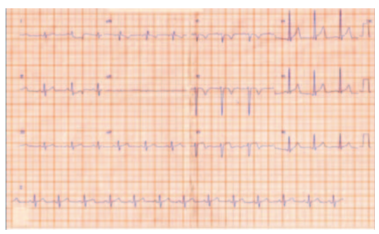
Fig. 1 - Resting electrocardiogram showing sinus rhythm, axis at 60 degrees, no overload, no progression of R-wave, and permanent T-wave inversion in V1 to V3.