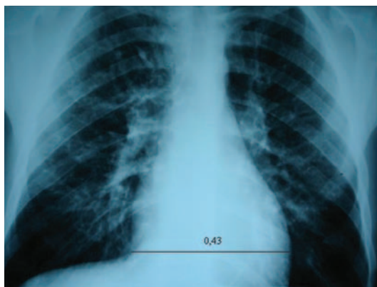
Fig. 2 - Chest radiograph showing situs solitus, cardiac silhouette with normal diameters (Danzer's ratio of 0.43), grade 4/4 increased pulmonary blood flow, and flat pulmonary trunk.