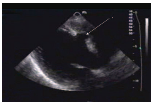
Fig. 3 - Doppler echocardiogram showing viscerocardiac situs solitus with levocardia and levoposition of the apex, presence of patent oval foramen with left-to-right shunt and large 30-mm muscular trabecular ventricular septal defect (*) extending to the infundibular region, with left-to-right shunt. Moderated increase of the left ventricle with preserved systolic function.