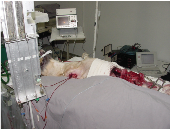
FIGURE 3 - Image of the animal underwent laparotomy with hemodynamic monitoring and evaluation of intestinal motility

Before the actual operation, the following procedures were performed: continuous monitoring of HR and rhythm through electrodes on the skin and dissection of the brachial artery and vein to measure, respectively, in MAP and CVP. Then, laparotomy was performed for implementation of the following: dissection of the vein and jejunal electrode fixation in jejunum biopsies of the bowel wall and partial occlusion of the portal vein during the pre and during occlusion. Aiming to assess the PP, the dissection of the jejunal vein was close to the cranial mesenteric vein and the duodenojejunal angle (Figure 3).