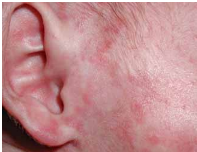
FIGURE 3: Patient #3. Annular lesions with erythematous, raised margins, with a lighter-colored center, located in the preauricular region

A 6-week old baby boy presented with raised annular lesions with erythematous margins and lighter-colored centers, on his face, preauricular region and on his neck, shoulder and abdomen, the lesions on the abdomen having atrophic centers. The condition had developed two weeks earlier (Figure 3). The child's mother had been diagnosed with SLE. Supplementary tests: WBC 13300/mm 3 ; hemoglobin 10 g/dl; hematocrit 29%; SGOT 149 IU/L; SGPT 96