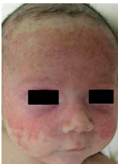
FIGURE 4: Patient #4. Erythematous lesion on the face

Neonatal lupus erythematosus (NLE) is characterized by the presence of skin lesions, abnormal cardiac function or both in newborn infants of mothers with auto-antibodies against Ro, La and/or, less commonly, U1RNP. It is a rare disease that affects approximately 1 in every 20,000 live-born infants, principally girls (65%), 5 although this trend was not seen in the