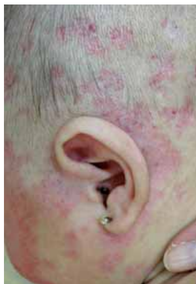
FIGURE 5: Patient #4. Annular, erythematous, slightly atrophic plaques with telangiectasia on the scalp, in the temporal-occipital region and neck

A 3-month old baby girl with an erythematous lesion on her face that consisted of small, annular, slightly atrophic plaques, bilaterally located on the temporal-occipital region and neck, with fine telangiectasias on the surface (Figures 4 and 5). In the genital region, an atrophic erythematous lesion with well-defined margins that developed two months previously. The mother had cicatricial alopecia, dry eyes, dry mouth and anemia but had not yet received any diagnosis at the time of consultation. Supplementary tests: hemoglobin 11.2 g/dl; hematocrit 33%; SGOT 265 IU/L, SGPT 212 IU/L; ALP 927 IU/L; C3 54 mg/dl; C4 2 mg/dl; ANF+ 1/1000, densely speckled pattern and anti-LA antibody positive (patient); ANF+ 1/2000, homogenous pattern and anti-LA and anti-Ro antibodies positive (mother). Histopathology: thick stratum corneum; thinning epidermis; intense vacuolization of basal keratinocytes in diffuse mononuclear dermal infiltrate. Thickened basal membrane (Figure 6). Direct immunofluorescence negative. Cardiac evaluation normal. Treatment: topical hydrocortisone