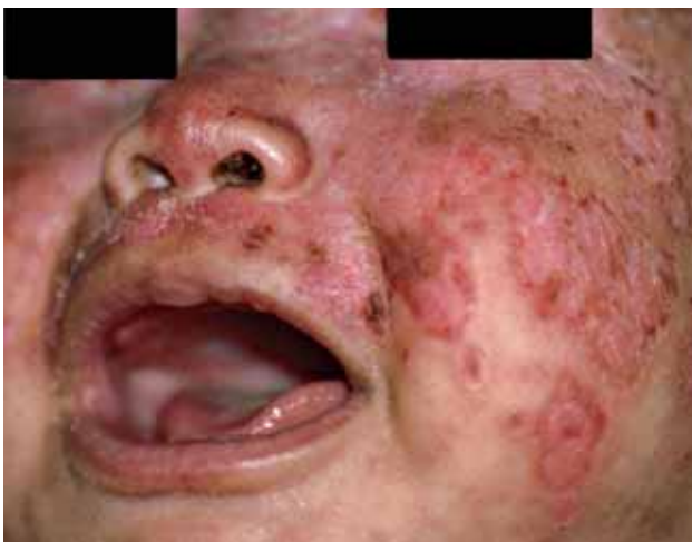
FIGURE 2: Patient #2. Erythematous, squamous, slightly atrophic lesions on the face, with polycyclic margins

A 4-month old baby girl with squamous erythe-