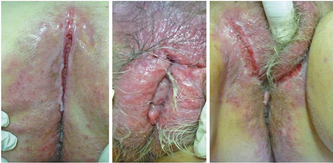
FIGURE 1: Clinical findings at presentation

(<5). Syphilis, HIV serologies and Mantoux test were negative. PCR testing for herpes simplex virus was negative. Chest X-ray showed no abnormalities. Based on the clinical and histological findings a vulvoperineal cutaneous Crohn's disease (CD) diagnosis was made. The patient was referred to gastroenterology for evaluation of bowel involvement. Endoscopic studies of the digestive tract and biopsies from the ileum, colon and rectum showed no abnormalities, so that a diagnosis of vulvoperineal cutaneous CD without digestive involvement was assumed. The patient went on daily metronidazole (1000 mg) and ciprofloxacin (1000 mg) with a striking improvement. Antibiotherapy was discontinued at 3 months and azathioprine (50 mg daily) was introduced. However, the condition worsened and metronidazole (1000 mg daily) was added to azathioprine and marked improvement was observed after 12 days. At 2 months of combined therapy (metronidazole 1000 mg plus azathioprine 150 mg daily) sustained clinical improvement was observed (Figure 3).