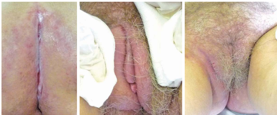
FIGURE 3: Clinical improvement with metronidazole and azathioprine at 2 months of therapy