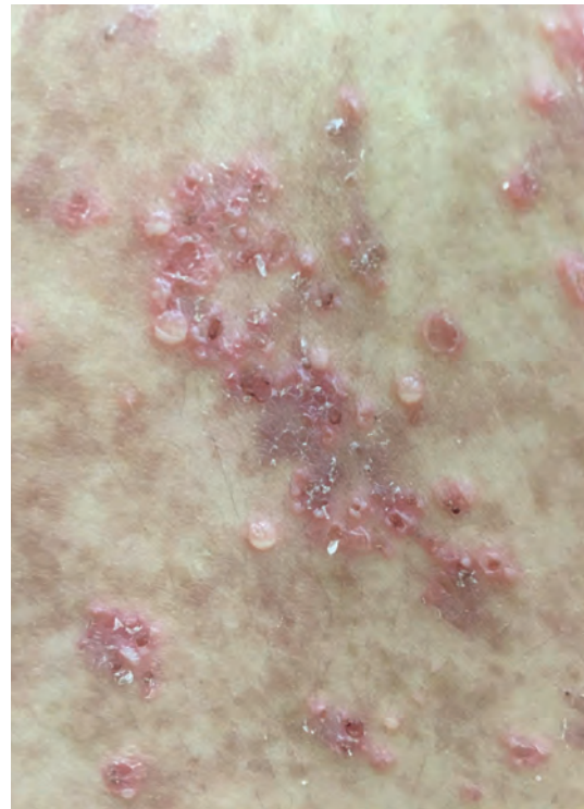
FIGURE 2: The “half-and-half” aspect of pustules with a serpiginous aspect, erythematous base and crusts