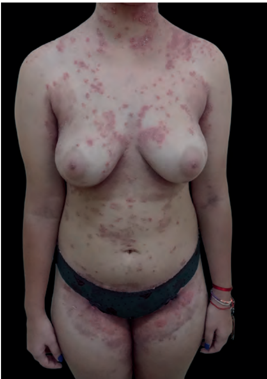
FIGURE 1: Before treatment: pustular eruption distributed throughout the trunk and flexor aspects of the limbs mingled with hyperchromic macules

reports of pediatric SPD have indicated that the clinical condition is similar both in children and adults. In 2013, Scalvenzi et al. reported a case of a 7-year-old patient with an erythematous-base pustular