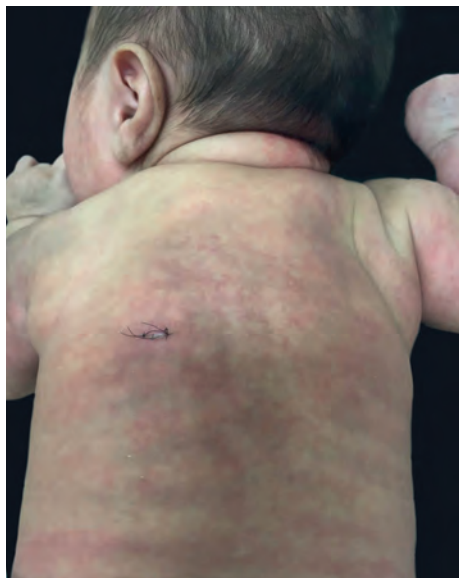
FIGURE 4: Significant improvement after one week

Management of patients with SFNN involves constant clinical follow-up for at least six months and laboratory surveillance of potential complications like hypoglycemia, hypercalcemia, and thrombocytopenia. 9 It is thus important to orient parents on the signs and symptoms of hypercalcemia in order to initiate prompt treatment. In the current case the patient remained in regular follow-up and evolved without complications (Figure 4). In general, since SFNN is a benign, self-limited condition, complete resolution of the lesions can be expected, without scarring. □