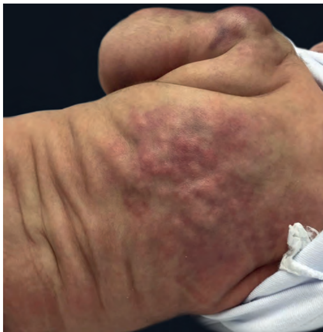
FIGURE 1: Multiple purple-erythematous nodules on the dorsum

Clinical-histopathological correlation confirmed the diagnosis of subcutaneous fat necrosis of the newborn (SFNN).