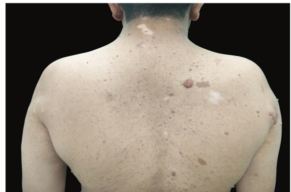
Figure 1 Café-au-lait macules, neurofibromas with perilesional halo, and vitiligo patches over the back.

brother. On cutaneous examination, multiple dome-shaped, skin colored papulonodular lesions of variable sizes and soft in consistency were present over the face, trunk, back, and extremities. Some nodules had depigmented halo around them. Multiple well-demarcated, light brown colored patches, 5–20 mm in size, were present over back, chest and upper extremities. Sharply demarcated patches of depigmentation suggestive of vitiligo, along with freckles, were present in both the axilla and over the trunk and