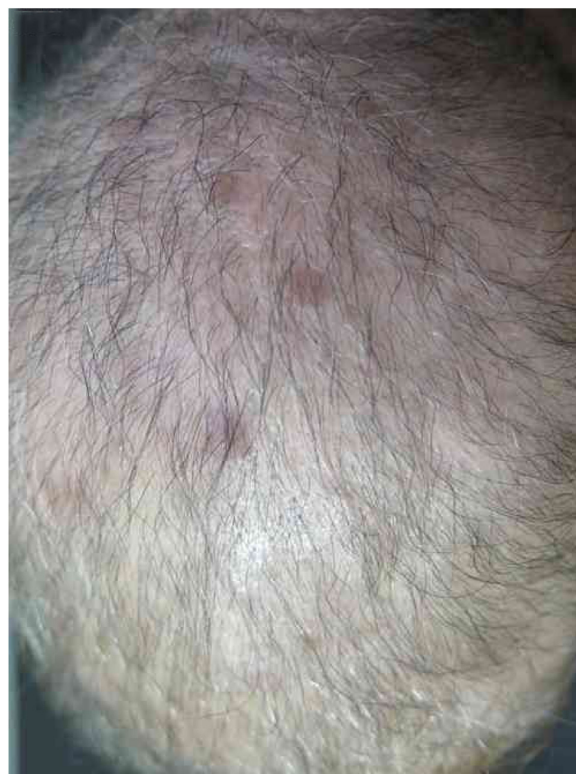
Figure 1 Scalp lesions.

Myeloid sarcoma, chloroma, or granulocytic sarcoma is defined by the World Health Organization as a solid tumor consisting of myeloblasts occurring in an anatomical site other than the bone marrow. Therefore, it should be remembered as a differential diagnosis of any atypical cellular infiltrate. 1 In addition, it is a rare tumor, with an incidence of two in every 1,000,000 inhabitants, and is difficult to diagnose. This disease has great association with myeloproliferative diseases, especially with acute myeloid leukemia, and may be the first manifestation of the disease in 5% of cases. Cutaneous manifestations are more often seen as hardened, purplish, purpuric-based nodules, about 1–2.5 cm in diameter and more rarely as plaques, erythematous macules, blisters, and ulcers; they may present as an erythematous rash in a polymorphic pattern. It more commonly presents as a solitary lesion in places like soft tissues, bones, peritoneum, and lymph nodes. In the case reported, the lesion was present on the scalp, a rare site of dis-