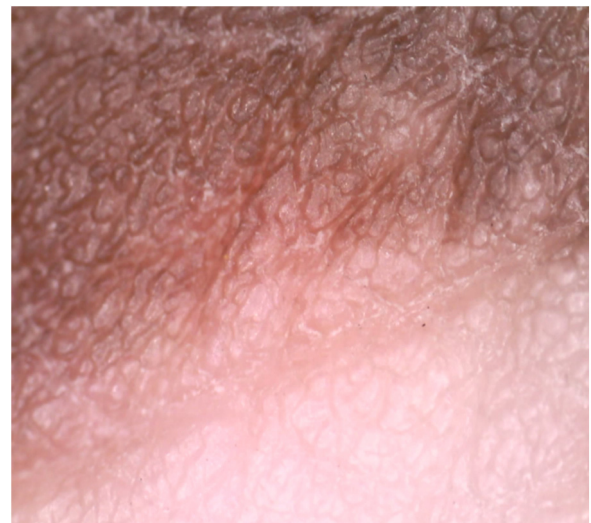
Figure 2 Border of a lesion on dermoscopy, showing reduced pigmentary network in the lesion compared to normal skin.