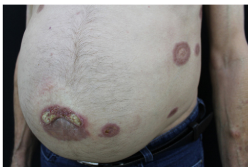
Figure 2 Detail of the lesion on the abdomen. Yellowish plaques on the abdomen.