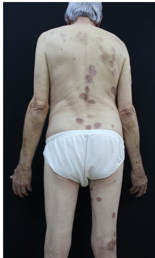
Figure 1 Lesions on the back. Yellowish infiltrated annular plaques with clear centers and erythematous borders.

A 73-year-old man, attended the dermatology outpatient clinic, with yellowish lesions on the trunk that had been present for two years. On physical examination, he showed infiltrated annular plaques with clear centers and erythematous borders on the thorax and abdomen, and asymptomatic lower limbs (Figs. 1 and 2). One of the lesions of the abdomen was ulcerated. He reported a previous diagnosis, about 20 years ago, of annular granuloma. A biopsy of the abdominal lesion was performed (Fig. 3) with the diagnostic hypotheses of necrotic xanthogranuloma, lipidica necrobiosis, annular granuloma, and xanthoma. Histopathology showed the dermis completely compromised by a chronic granulomatous process with numerous Touton cells, some bizarre, and areas of necrobiosis with nuclear