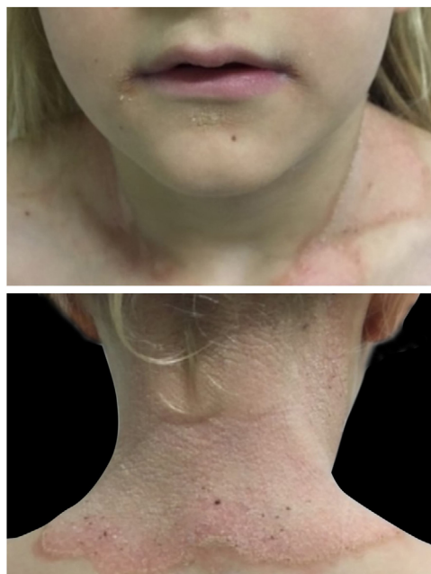
Figure 2 Erythematous, hyperkeratotic plaque, with prominent and geographical border in the cervical region. Yellowish keratotic plaques at the angle of the mouth and chin.

AEI was first described in 1992 by Sahn et al. 5 and is the result of dominant mutations in the keratin 1 and keratin 10 genes. 1-7 Individuals with this variant may present with bullous ichthyosis at birth and hyperkeratotic lichen plaques on the areas of flexion and extensor surfaces in the first years of life. 1 Characteristically, they also develop recur-