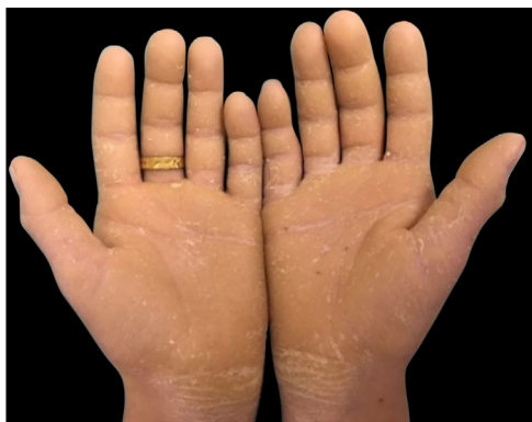
Figure 1 Hyperkeratosis in palms.

plaques with prominent borders, affecting the mesogastrium, cubital fossae, popliteal fossae, and inguinal and cervical regions, as well as palmoplantar hyperkeratosis and yellowish hyperkeratotic plaques on the scalp and nasal introitus (Figs. 1, 2 and 3A). No associated changes in hair, nails, or mucosa were observed.