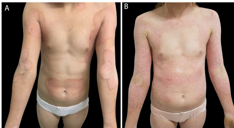
Figure 3 (A) Erythematous, keratotic plaques with prominent and geographical borders on the arms, forearms, cervical, armpits, lateral region of the trunk, and umbilical and supra-umbilical regions. (B) The same patient a month later, presenting erythematous and hyperkeratotic plaques along the entire arm, forearm, and anterior chest, sparing the umbilical and supra-umbilical regions.

In the histopathology, the hyperkeratotic lesions of the AEI revealed hyperkeratosis, acanthosis, and a thickened granular layer. Keratinocytes in the spinous layers and superior granulosa of the epidermis demonstrated cytoplasmic vacuolization and prominent keratohyaline granules. 1,2,4,6 Basal keratinocytes appeared normal, but there was an increase in the number of mitoses. Regarding findings from electron microscopy, there were abnormal keratin filaments in the suprabasal keratinocytes, increase of kerato-hyaline