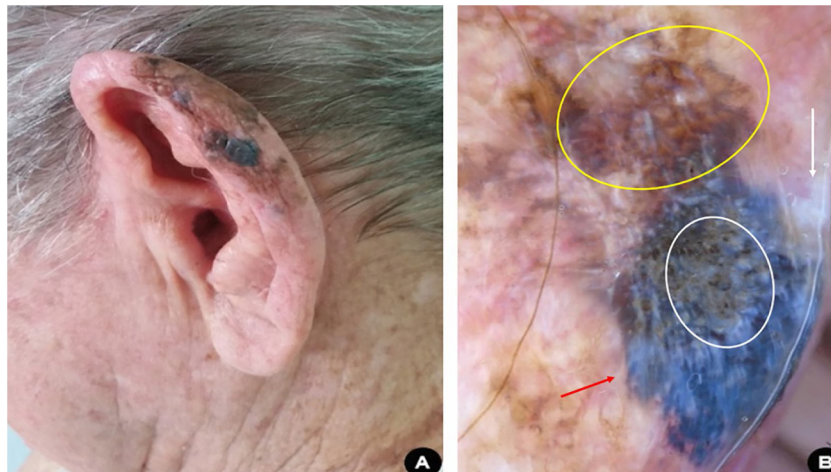
Figure 3 (A), Pigmented, multicolored, asymmetric lesion, with slightly elevated areas on the helix of the left ear. (B), Dermoscopy suggestive of superficial spreading melanoma: blue-white veil (red arrow); irregular dots and globules (white circle); area with rhomboidal structures and asymmetric pigmentation of follicular ostia (yellow circle); white depigmentation area (white arrow).