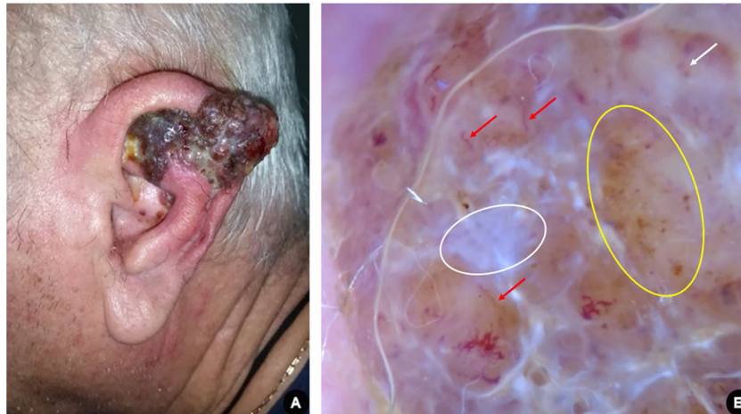
Figure 2 (A), Erythematous-violaceous exophytic tumor affecting the left ear helix with the presence of confluent satellite papules. (B), Dermoscopy suggestive of nodular melanoma: bluish-white veil (white circle); atypical vascular pattern, with irregular linear vessels (red arrows) and milky red globules (white arrow); irregular dots and globules of asymmetric distribution (yellow circle).