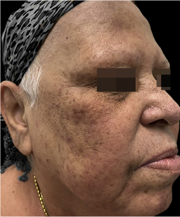
Figure 3 Post-inflammatory hyperchromia without the presence of pustular lesions.