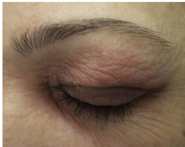
Figure 1 Allergic contact dermatitis caused by Kathon CG found in cosmetics.

The mean age of patients was 45 years. Regarding ethnicity, 114 (50%) were white, 42 black (18%), 68 were brown (30%), and 4 were yellow (1.75%). Regarding atopy, 91