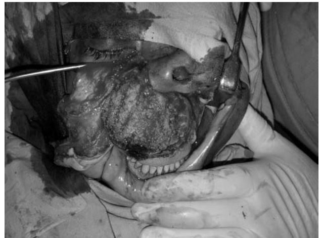
Figure 2. The bone cavity obtained during the surgical resection of the maxilla brown tumor.

On imaging examination, brown tumors are usually well-defined purely lytic lesions that stimulate little reactive bone formation (4,14). The cortex may be thinned and expanded, but is not often penetrated. Attenuation values observed on tomography (CT) scans usually fall within the range found in blood and fibrous tissues.