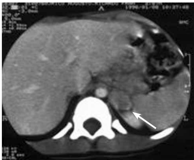
Figure 2. Abdominal computerized tomography showing a 2.0 cm mass in the left adrenal gland.