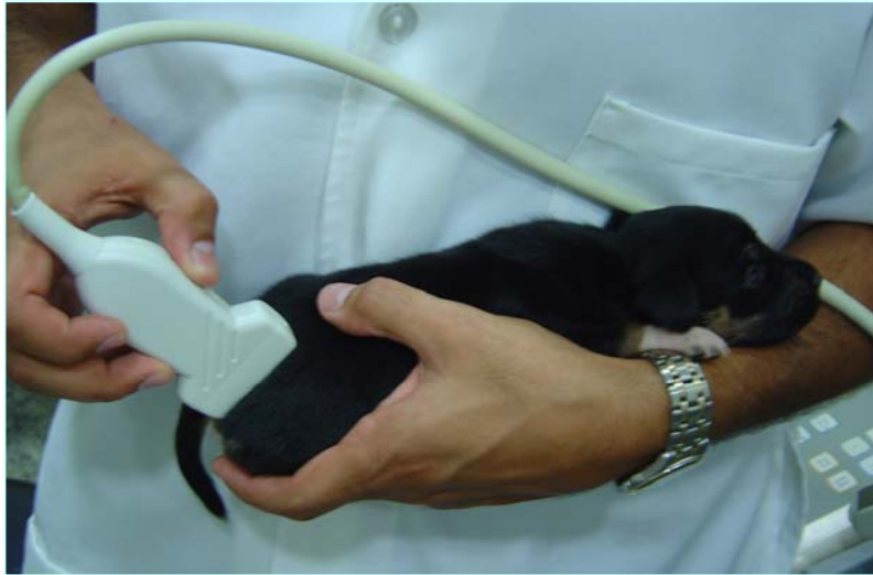
Figure 1. Transducer position for a dorso-lateral ultrasonographic image of a coxofemoral joint of a 15-day-old Rottweiler puppy.