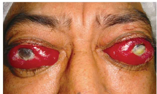
Figure 4. Bilateral globe subluxation in the inflammatory phase of GO. Note melting of the left cornea.