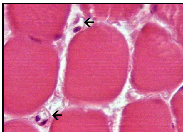
FIGURE 1 - Photomicrography of right vastus medialis muscle. Transversal cut of the portion more proximal to the occlusion of right femoral artery showing the endothelial cells of capillaries (arrow) between the muscular bundles. Hematoxylin-Eosin – 400x.

After 10 weeks of endurance training it was observed an increase of the number of capillaries in muscular tissue in the animals of group trained ( 5,2 \pm 0,83 , p < 0,05 ) when compared with the animals of group sedentary ( 1,6 \pm 1,14 ) (Figures 1 and 2).