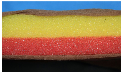
FIGURE 4 – Incision layers. A. Skin (pantyhose). B. Subcutaneous (sponge's yellow side) C. Muscle (sponge's red side). D. Parietal peritoneum (pantyhose).