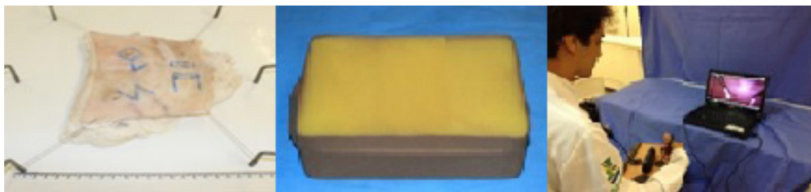
FIGURE 1 – A. Swine abdomen. B. Bahiana box. C. Black box.

The flaps and grafts experiment preparation is made using a 200 mm x 150 mm swine belly area, fixed on a table with nylon and screws. The incision areas are marked on the skin for the execution of total cutaneous graft, advancement flap, Limberg flap and Z-plasty, as seen in Figure 1A.