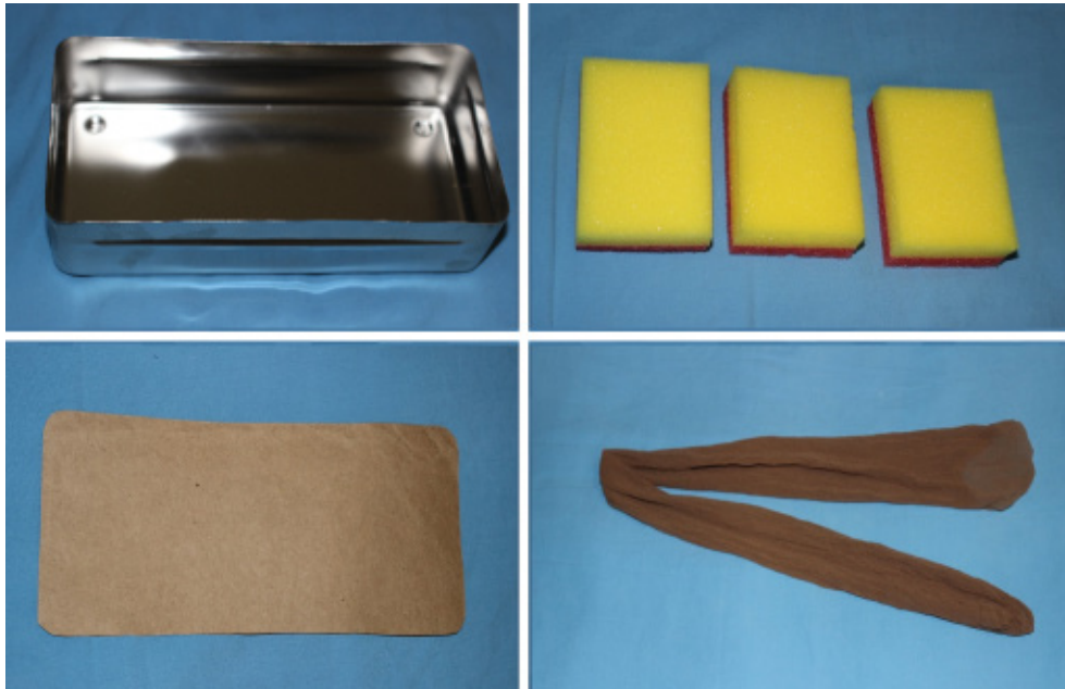
FIGURE 2 – Required materials for surgical model Bahiana box assembly. A. Inox box. B. Cardborad internal coating. C. Three sponges. D. Half pantyhose. E. Swine small intestine.

The assembly process is demonstrated in Figure 3. With this model is possible to create a visceral space for the small intestine and build four layers of incision, represented in Figure 4.