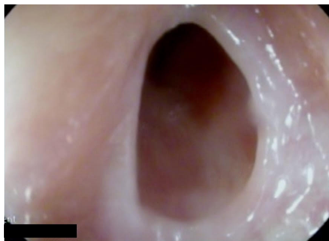
FIGURE 1. Simple benign esophageal stricture in the upper part of the esophagus in case 2.

Under unconscious sedation with intravenous Propofol, Savary-Gilliard dilations (SGD) were performed. All procedures were performed without fluoroscopy guidance, as reported by Kabbaj et al. (5) A guide-wire was placed endoscopically. In one single session dilations using bougies were performed until reaching 15mm (45Fr) in all cases, with a total of 294 dilations in all cases. The set implemented was one formed by 7 bougies: 5mm (15Fr), 7mm (21Fr), 9mm (27Fr), 11mm (33Fr), 12.8mm (38Fr), 14mm (42Fr), and 15mm (45Fr) subsequently (FIGURES 1 and 2). After dilation, the esophageal mucosa was inspected for ruling out any adverse event. Patients were given an appointment for a visit to the clinic usually 3-6 weeks after SGD.