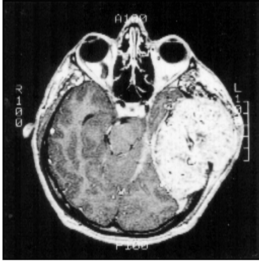
Fig 1. T1-weighted magnetic resonance image. Axial view with gadolinium enhancement showing a well-circumscribed lesion causing mass effect against temporal parenchyma.