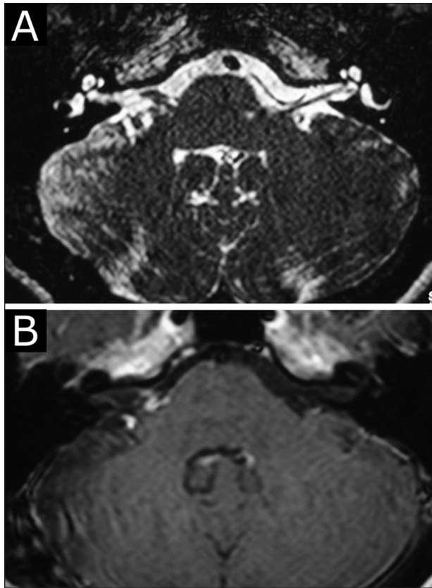
Fig 2. (A–B) Postoperative MR axial T2 and T1 Gad-weighted images demonstrating no recurrence two years after surgery.

closure. The time spent on the tumor dissection was approximately four hours.