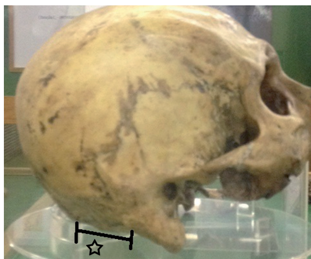
Fig 2. The same cranium in a lateral view. The occipital bone is horizontal and the posterior fossa is small (star).