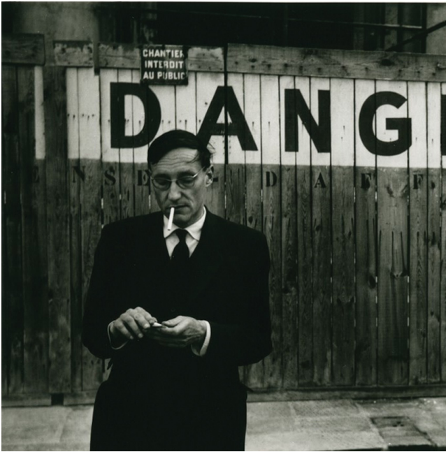
Figure 2. William Burroughs.

the temptation to quit medical school, he found solace in the depiction of doctors by Burroughs, particularly the abject Doc Benway. The introduction of apomorphine as a treatment for PD is also related to Burroughs, who himself underwent apomorphine treatment for his heroin addiction 2,3 . He was persuaded not to run a clinical trial of LSD in PD, after reading Burroughs' comments considering it dangerous because of the unpredictable nature of its effects. Lees' experiences of self-experimentation with anti-parkinsonian agents are also paralleled to Burroughs' extensive drug use. The most amusing of them is his intake of deprenyl, which changed his behaviour in a manner that led his wife to ask him to remain on it indefinitely (the reader is left unaware if he complied with her request). Overall, the imputed intersections between Lees' career and Burroughs' works seem less convincing of a genuine mentorship and more suggestive of coincidence or, as both would certainly prefer, synchronicity. These allusions are indicative of the unconventional nature of Lees and a reiteration of his fidelity to the spirit of the 1960s generation. This is supported by the only instance in the book where Burroughs undeniably mentored Lees: while investigating the therapeutic possibilities of yagé, Lees actually used ayahuasca.