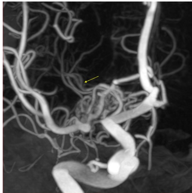
Figure 3. Multiplanar reconstruction of rotational angiography showing the presence of lenticulostriate arteries (arrow) arising from the anomalous proximal rete middle cerebral artery.