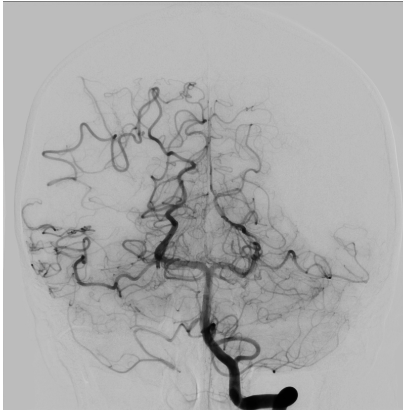
Figure 4. Frontal view of a vertebrobasilar angiogram demonstrating pial collaterals contributing to temporal and parietal vascular territories.