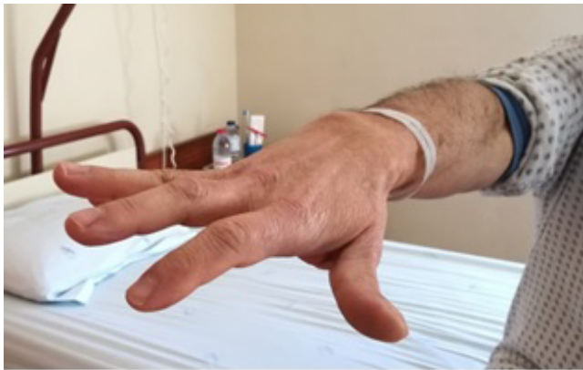
Figure 1. Photograph of the involved hand, evidencing a tendency toward the flexion of the right index finger, since the patient could not fully extend, adduct, and abduct it.

finger following HK stroke and strengthens the existence of finger somatotopy in human motor cortex 1,2 . This observation helps clarifying motor cortex anatomy and clinical correlations, further detailing the Penfield's homunculus 3 , its first proposed somatotopic organization.